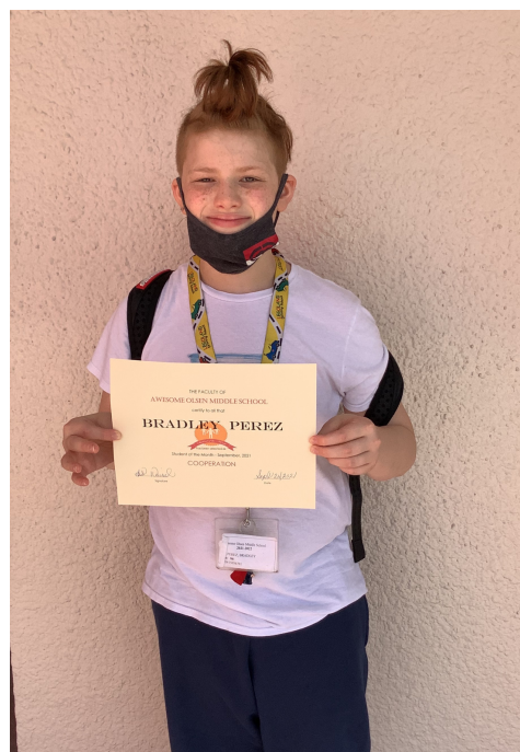
Above: Scholars posing with their Student of the Month Certificates!