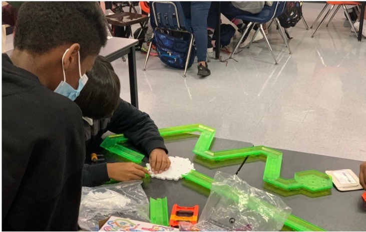
Above: Robotics and Marine Science scholars learning to problem solve.