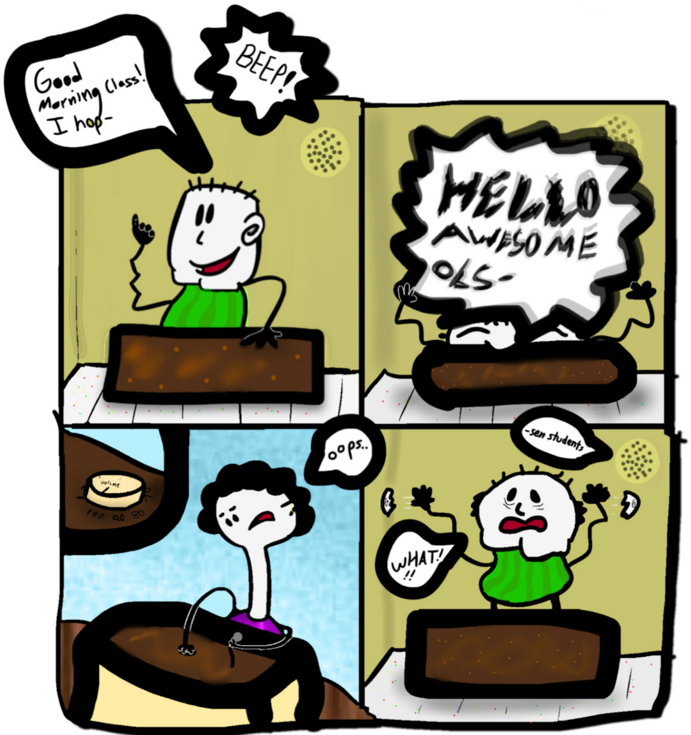
Comic by Matias Pica