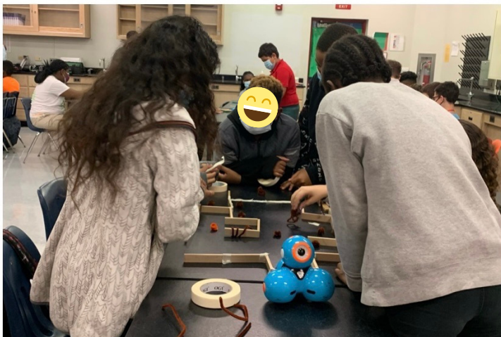
Above: Robotics and Marine Science scholars learning to problem solve.