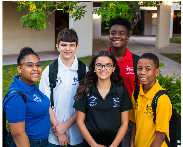
Above: Awesome Olsen Scholars wearing polo shirts representing each of the five iCan Magnet Academies. Polo shirts are available to purchase through the school website.