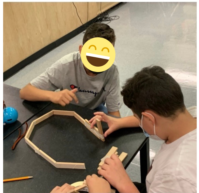
Above: Robotics and Marine Science scholars learning to problem solve.